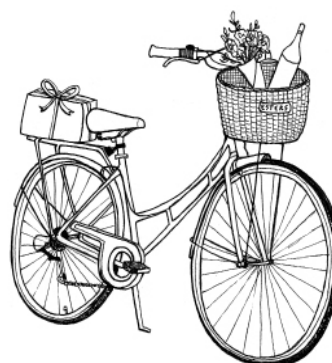
ILLUSTRATION JASPER S